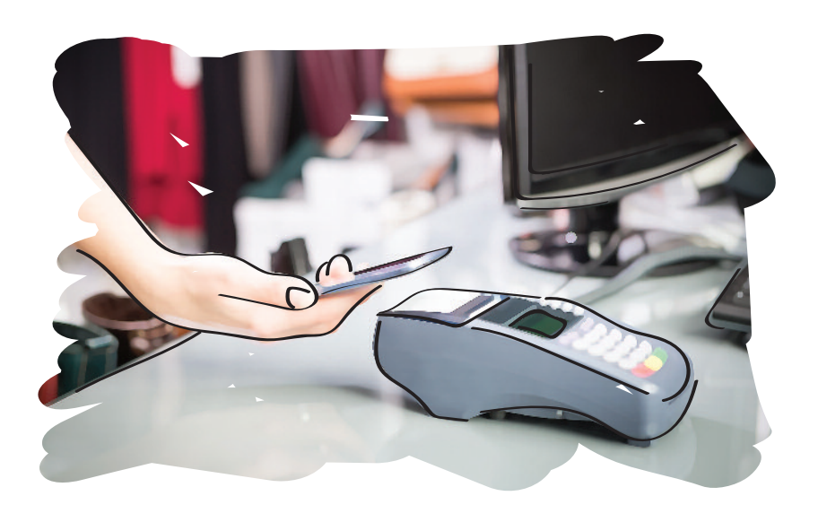
The UK Cards Association thanks Visa Europe for providing the quotes from retailers used in this guide

The UK Cards Association 2 Thomas More Square, London E1W 1YN Telephone 020 3217 8200 www.theukcardsassociation.org.uk